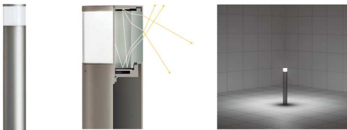
H320mm 5000K / CRI.83

STANDARD POLE LIGHT (General Diffusion type) It efficiently diffuses light and illuminates the passage and the surrounding landscape brightly.